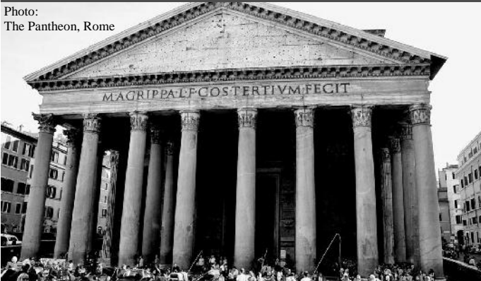
Photo: The Pantheon, Rome

D uring May we move from the Gospels to the book of Acts. Acts begins "In my former book, Theophilus, I wrote about all that Jesus began to do and to teach until the day he was taken up to heaven" (Acts 1:1-2). This book is Luke's sequel to his Gospel and his point is that, even though Jesus has ascended to the Father, he hasn't finished building his kingdom; in fact he's just getting started.